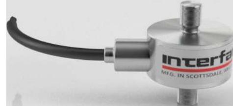
Model WMC (Shown)