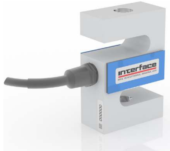
MODEL SSM-FDH (Shown)