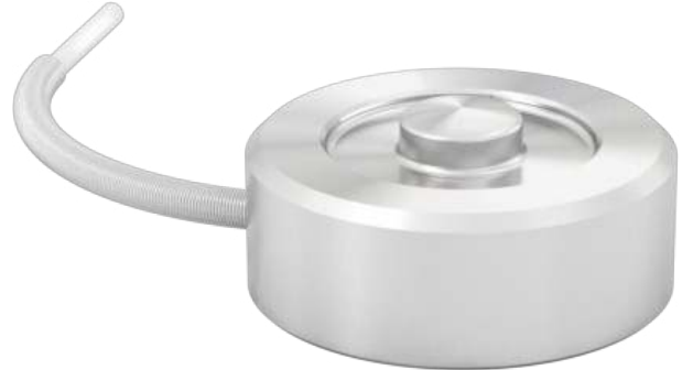
Model LBM-5K (Shown)